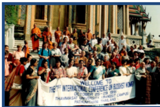
1st International Conference 1991